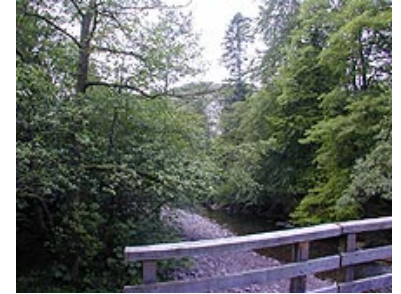
Bridge over River Tawe

From the fountain in the parking area of Craig-y-nos Castle, head North through an archway and then bend right around the Northern castle walls. Descend to a grassy path again heading North, to access Craig-y-nos Country Park. At the confluence of the rivers Tawe and Llynfell, you will see an oak bridge.