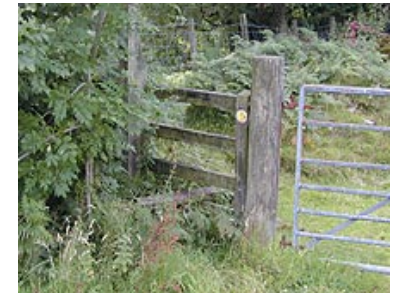
Stile before Pant-y-Wal Farm

300 metres up the hill, and before you reach the farm, look for a way-marked stile next to an iron gate on the left, as the road turns sharply right (see picture on right). Cross the stile and follow an obvious track South-Westerly, keeping a fence on your left. Keep going straight on across the fields through 3 gates/stiles and at the 4 th stile, cross and bear immediately right, heading for a stone wall with a wooden gate in it.