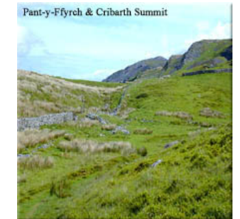
Pant-y-Ffyrch & Cribarth Summit