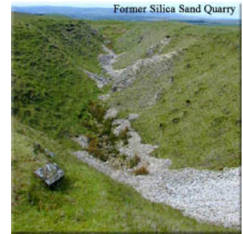
Former Silica Sand Quarry

At the top of the incline continue walking north-east, following sheep tracks to the summit of Cribarth (423 metres, 1387 ft.), where there is a cairn and white trig-point. Pause to look at the spectacular panoramic views before descending from the summit in a North-Easterly direction to meet a stone wall with a wire fence on the top.