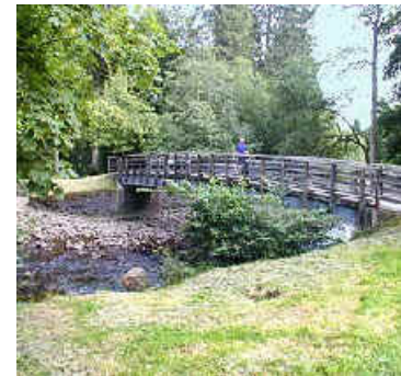
The Oak Footbridge

Cross the main road and retrace your steps by the pond, across the duck-boarding, then the footbridge or stepping stones and into the rear entrance of the Park. Keep to the main gravel track, which turns grassy but follows the river Tawe downstream. At the confluence with the river Llynfell, bear right across an oak footbridge and right again to walk upstream of the Llynfell. After 50 metres turn left and at the Duck Pond turn left again to arrive at the Country Park car park, where there is a National Park Information Office. Here you can view an exhibition of the history of the area, and purchase souvenirs, maps and National Park publications. Exit from the main gate to the A4067, turn left and left again to re-enter the Castle grounds.