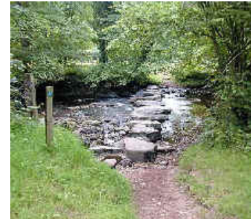
The Stepping Stones

At a wooden fence by a notice board, go left, either across stepping-stones or the wooden bridge in front of you. Be careful, as the stepping-stones can be slippery in wet weather. Go straight ahead at a gate (or stile) and bear right at a copse as the wire fence goes off to the left. After 30 metres you will see an old ford across the river Llynfell, which is too deep to cross on foot now. Keep straight on to a gate/stile and 20 metres later turn left to walk beside the river on a permissive path.