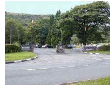
Entrance to National Showcave Centre

Turn left here towards the caves and view the rare-breed farm on your right, if you wish, before turning left and ascending the short hill to the Caves.