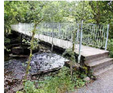
Bridge over River Tawe

At the far end of the field, turn left and walk beside a fence to come to a stile, which leads down to the river. Turn left before the stile and continue Northerly, along the edge of a hay meadow. Look for a plaque commemorating the planting of an oak tree in 1914 on your right. Go through an ornate white Iron Gate (which has a date of 1881 on it) and continue to follow the River Tawe upstream to a white Iron Bridge, which contains the initials "A P" within the railings.